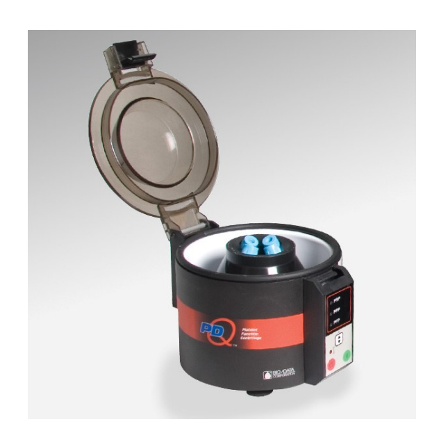
The PDQ®, Platelet Function Centrifuge is Optimized for Consistent Sample Quality